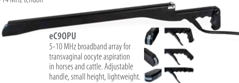
eC90PU 5-10 MHz broadband array for transvaginal oocyte aspiration in horses and cattle. Adjustable handle, small height, lightweight.