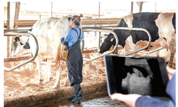
STREAMING NOW BUILT-IN...