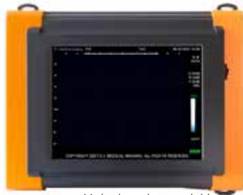
Multiple probes available

The HR adds a sunlight-readable screen to the LITE—the HR also works with video headsets, offering versatile options for viewing scans in real time.