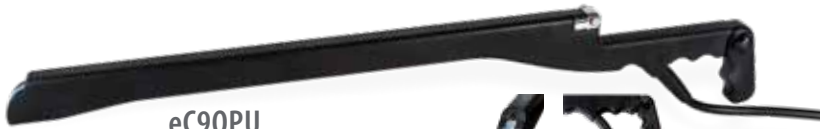
eC90PU 5-10 MHz broadband array for transvaginal oocyte aspiration in horses and cattle. Adjustable handle, small height, lightweight.