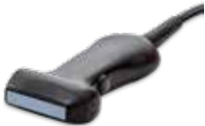
eL14 6-14 MHz tendon